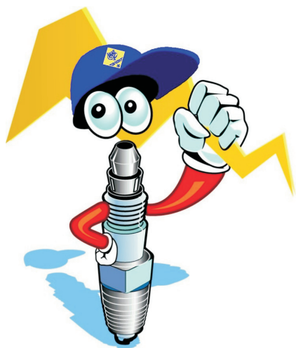
Watch for Lightning