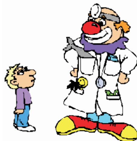
By Salt Lake Council